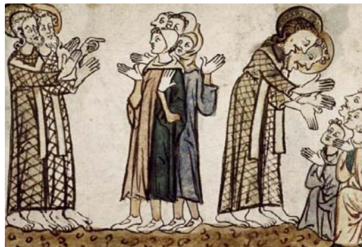
Rev.XI, 3-6. The two witnesses testifying to the populace (from) Bodleian MS. Auct. D. 4. 14